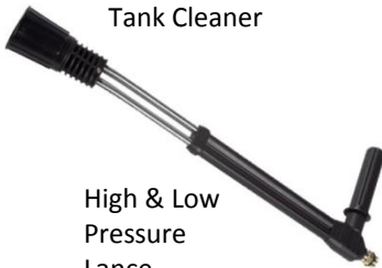
High & Low Pressure Lance